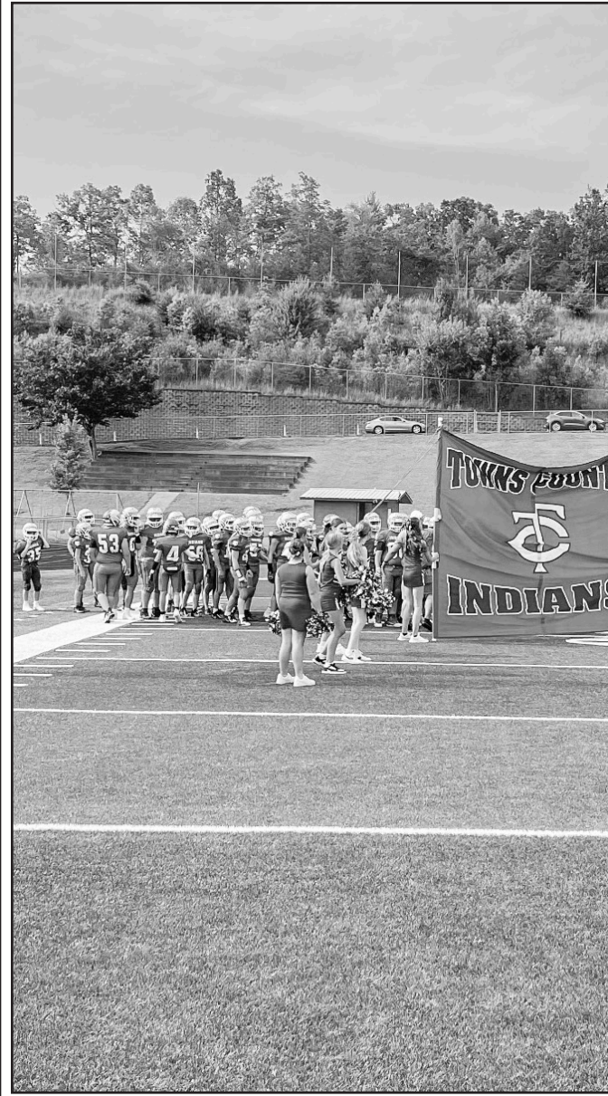
The Towns County Middle School Indians football team prepares to take the field ahead of last week's 39-8 blowout victory over Pickens.